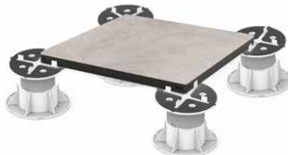
GRO Paver Grate on GRO Pedestals with Porcelain Paver

GRO Paver Grate enhances impact resistance for porcelain pavers in pedestal applications. It also provides a structural surface for loose laid pavers on deck pedestals. Engineered to attach to the pedestals, the GRO Paver Grate creates a stable and secure foundation and mitigates wind uplift resistance. Multiple options are available for adhesion to porcelain pavers.