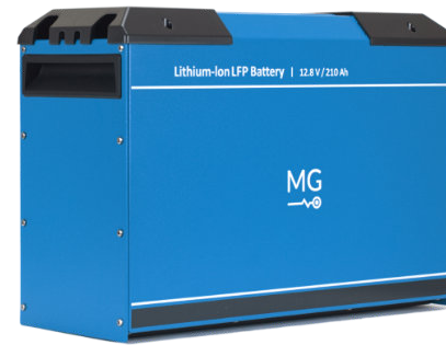
LFP battery modules 12.8 V - 2.7 kWh

This robust battery is based on the next generation LiFePo4 chemistry. The advantage of this next generation chemistry is the higher energy density. The modules are very compact and light weight with high charge and discharge capability. The 12.8 V LFP series can be used for applications in various markets such as mobile and marine. Scalable and reliable battery banks can be created while keeping the ease of installation and the minimum use of external components.